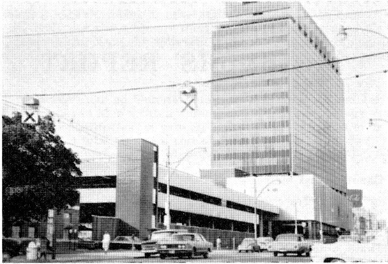
Canada Square parking garage at Eglinton station accommodates 450 automobiles on two floors. The garage provides convenient parking for people who wish to travel downtown on the subway.