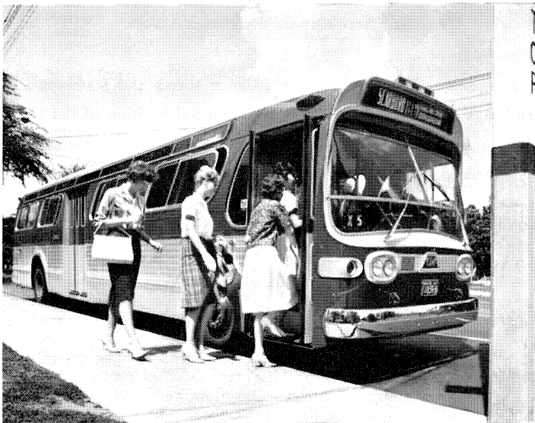
During 1963, the Commission took delivery of 105 new air-ride buses. The cost of providing this improved quality of service was more than $3,500,000.00.