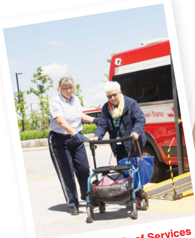
Family of Services customer handbook