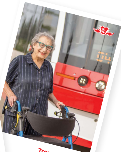
Travel Training Handbook

For any questions related to your eligibility, please contact wteligibility@ttc.ca or 416-393-4111.