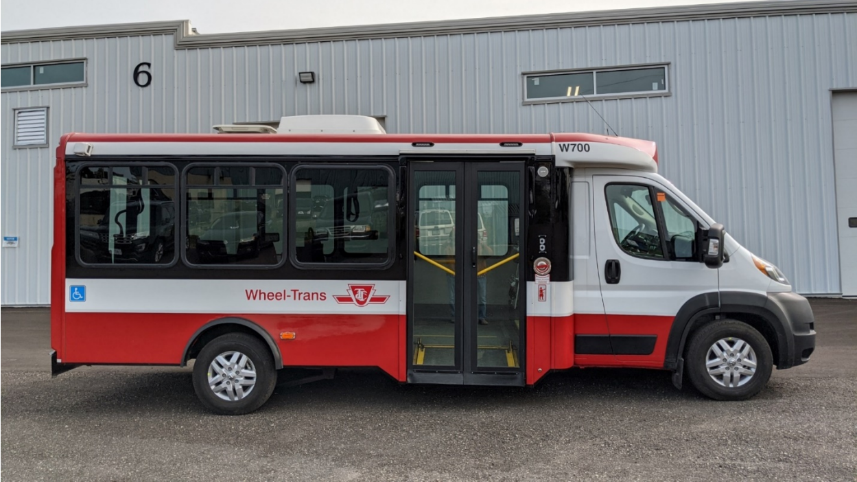
Photo 3 shows the seven-metre Pro Master pilot vehicle.