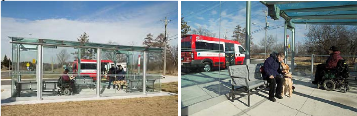
Figure 2: Access Hubs

Photo 1 (left) is a picture of the Meadowvale Access Hub taken from outside the Access Hub. There is one customer in a wheelchair inside the Access Hub and another customer with their guide dog entering the Access Hub. Photo 2 (right) is a picture of the same customers taken from inside the Access Hub. In both pictures there is a Wheel-Trans Pro Master min-bus in the background.