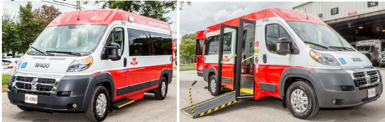
Figure 4: Dodge Pro Master mini-bus

Photo 1 (left) shows the Wheel-Trans Dodge Pro Master mini-bus facing the front, driver's side of the vehicle.