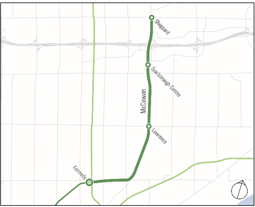
Figure 2. Proposed Line 2 East Extension concept.

The Province's L2EE concept is the McCowan three-stop concept that the City and TTC last considered in the July 2016 report to Council (Figure 2).<sup>2</sup> This alignment would connect to Line 2 at Kennedy Station and follow Eglinton Avenue East, Danforth Road and McCowan Avenue to Sheppard Avenue East, with proposed stations at Lawrence Avenue East, Scarborough Centre and Sheppard Avenue East. A station at Eglinton Avenue East and Brimley Road is being considered either as an alternative to a Lawrence station, or as a potential fourth station, which is one of the considerations to be addressed in the further assessment of this Provincial project.