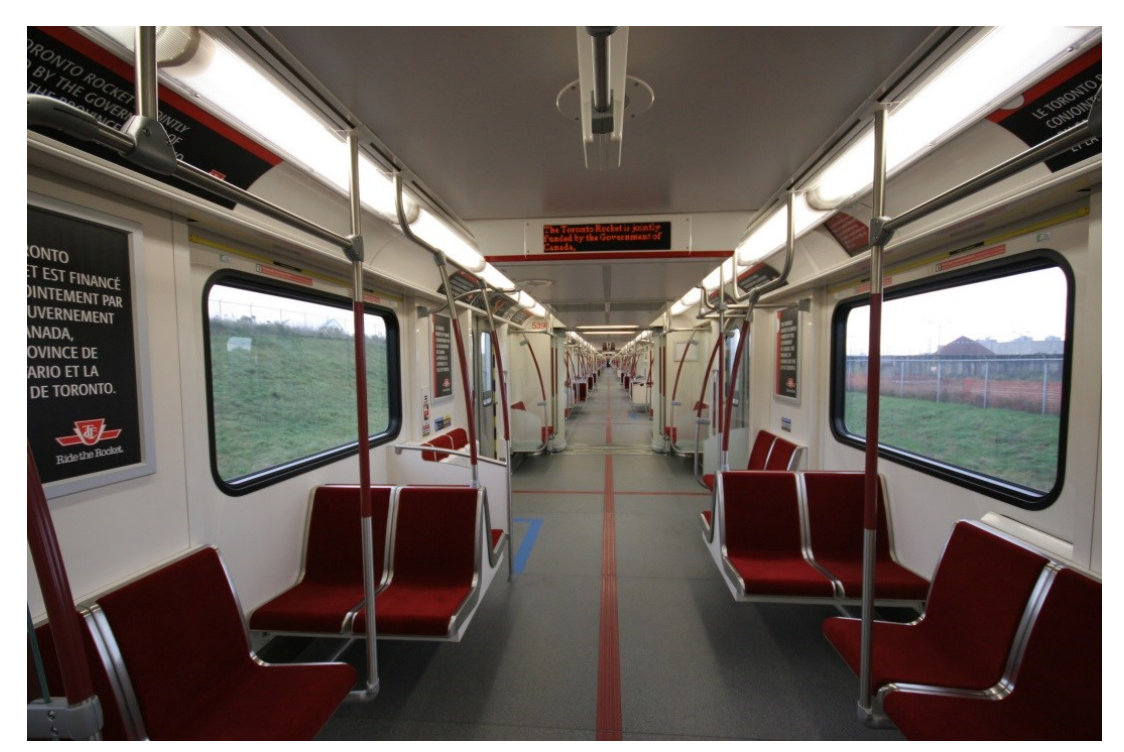
Figure 3: Open-gangway Toronto Rocket train