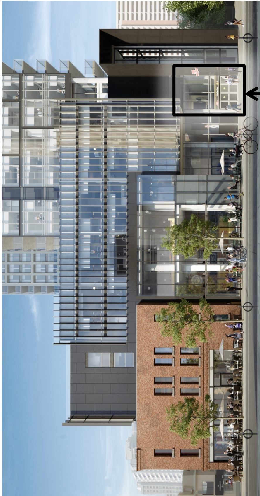
Looking North from Dundonald Street at Development at 587 Yonge Street – Entrance to Wellesley Station is on the east side of the building.