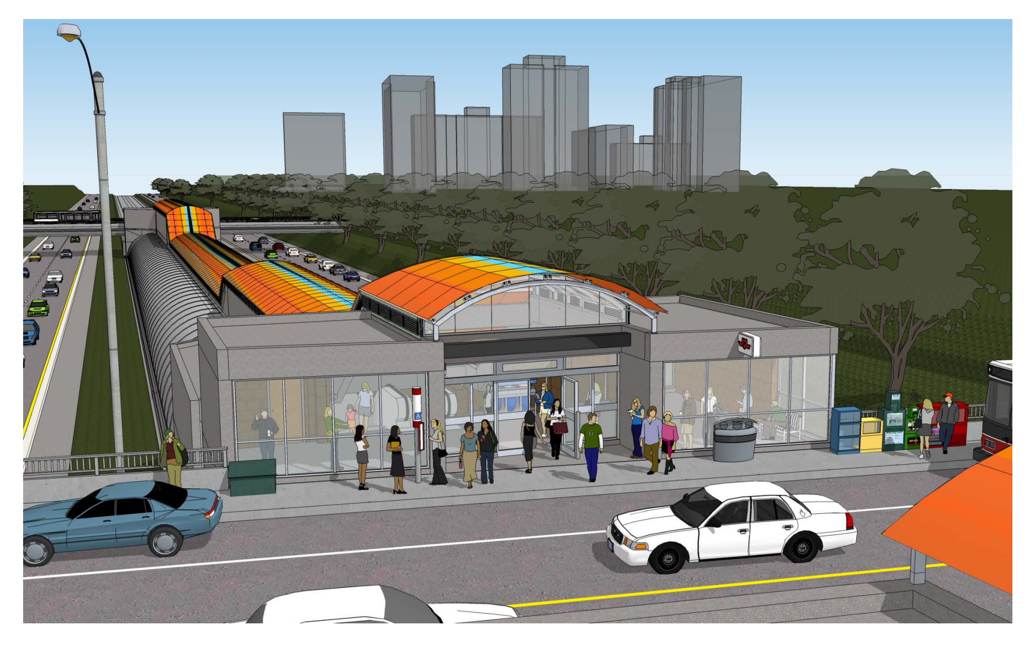
Exhibit 1 Public Art Concept – "Joy" View looking south from Glencairn Avenue