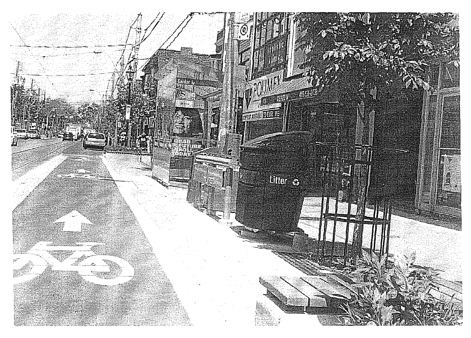
Garden Ave., N.S. planter, tree, garbage rec., metal barrier,3 paper boxes, hydro pole, shelter, tree, TTC stop, planter