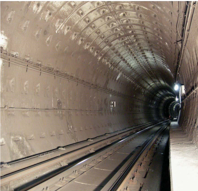
After Insulation Removal