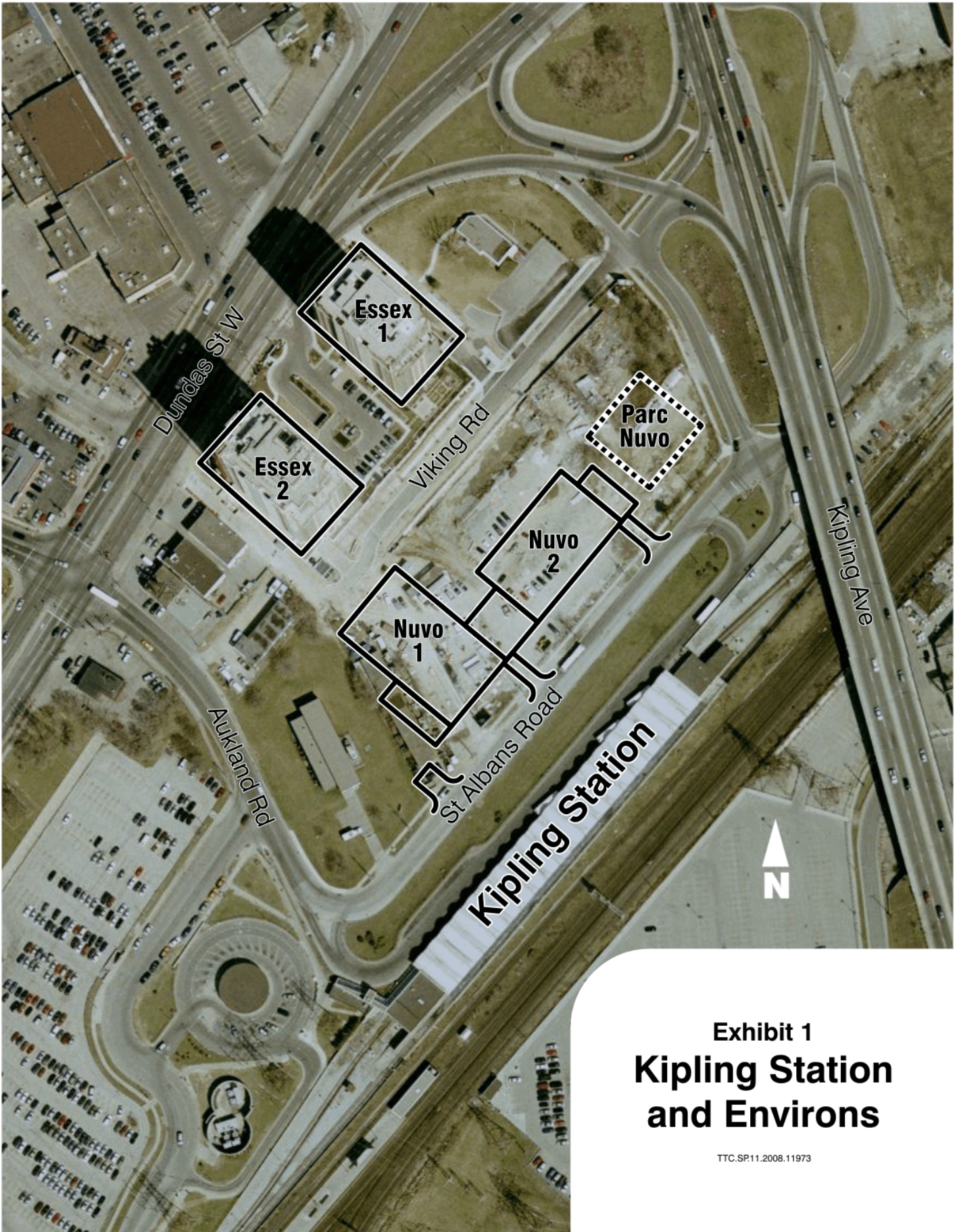
Exhibit 1 Kipling Station and Environs