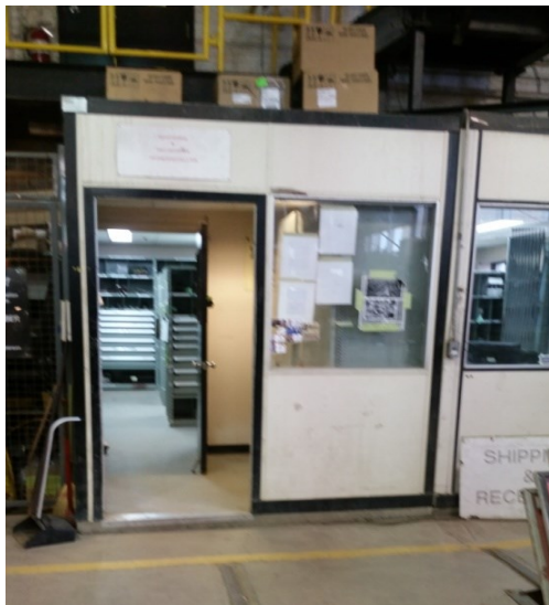
Figure 6: An Example of an Open Store Located Inside a Garage

As of December 31, 2015, the inventory on-hand at the 18 open stores amounted to $14 million, averaging approximately $790,000 per store.