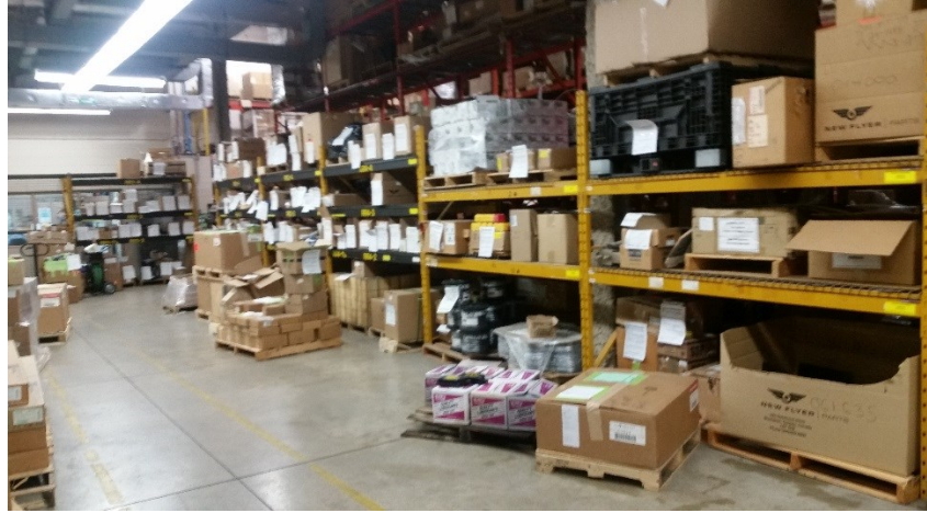
Figure 2: Duncan Warehouse Returns Storage Area

As part of our audit, we selected a sample of five returned orders to confirm that they were in the warehouse. We could only locate a portion of one of the five orders in the warehouse.