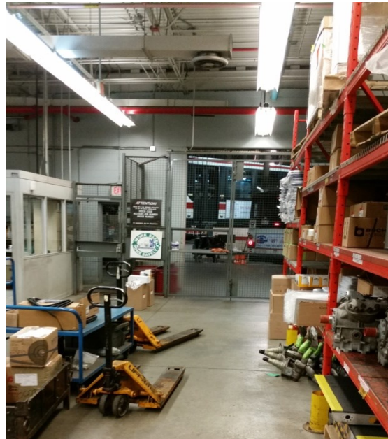
Figure 5: View from the Inside of a Closed 24/7 Store Facing the Maintenance Garage

Following our 2014 audit report on bus maintenance, TTC staff have made concerted efforts to convert the five largest stores in bus garages to a 24/7 closed store operation. Approximately $7 million worth of bus parts and supplies are stored at these five sites. At closed stores all inventory is stored inside an enclosed secure area and can only be accessed by Materials Management staff. See Figure 5 of an example of a closed store.