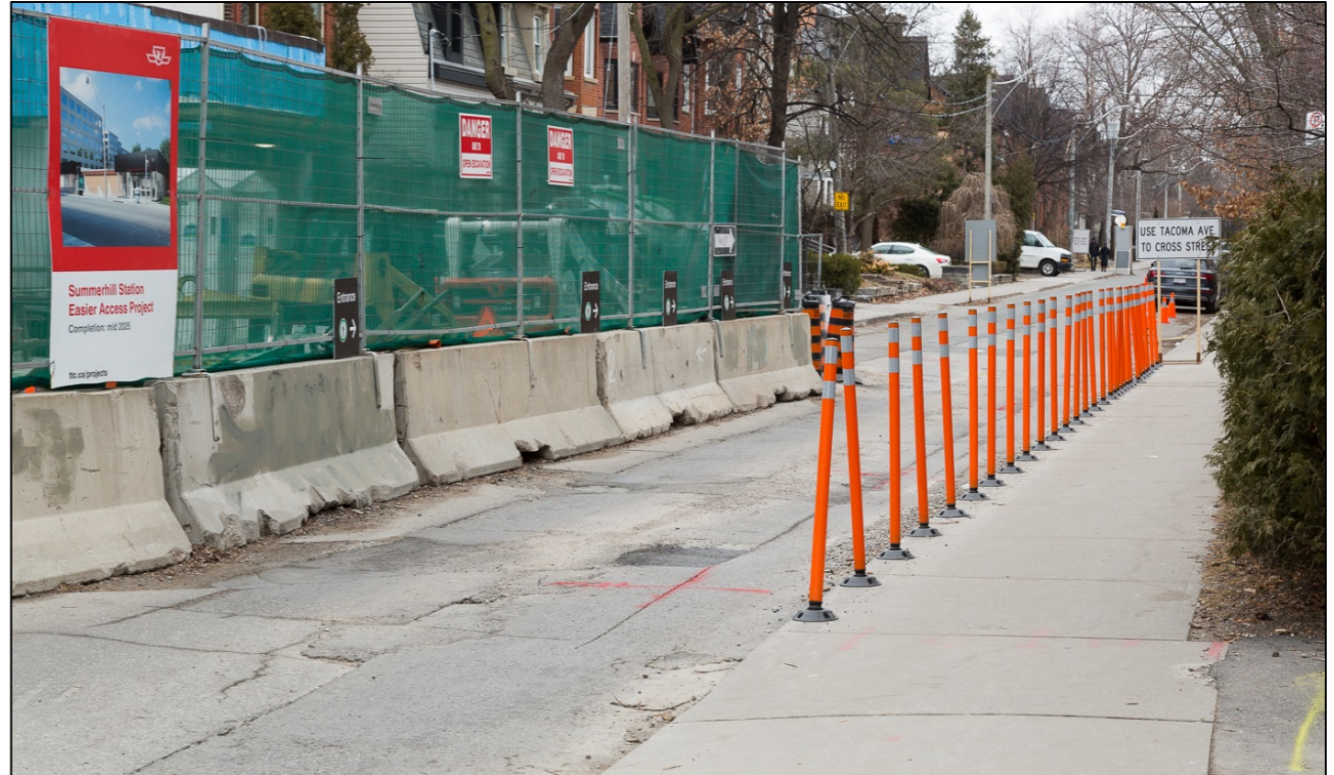
Picture- Outside the construction site on Shaftesbury Avenue