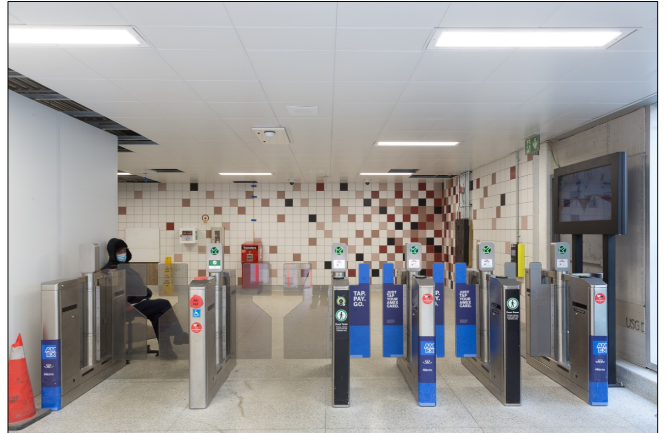
Picture- The fare gates by the new main entrance at Summerhill Station