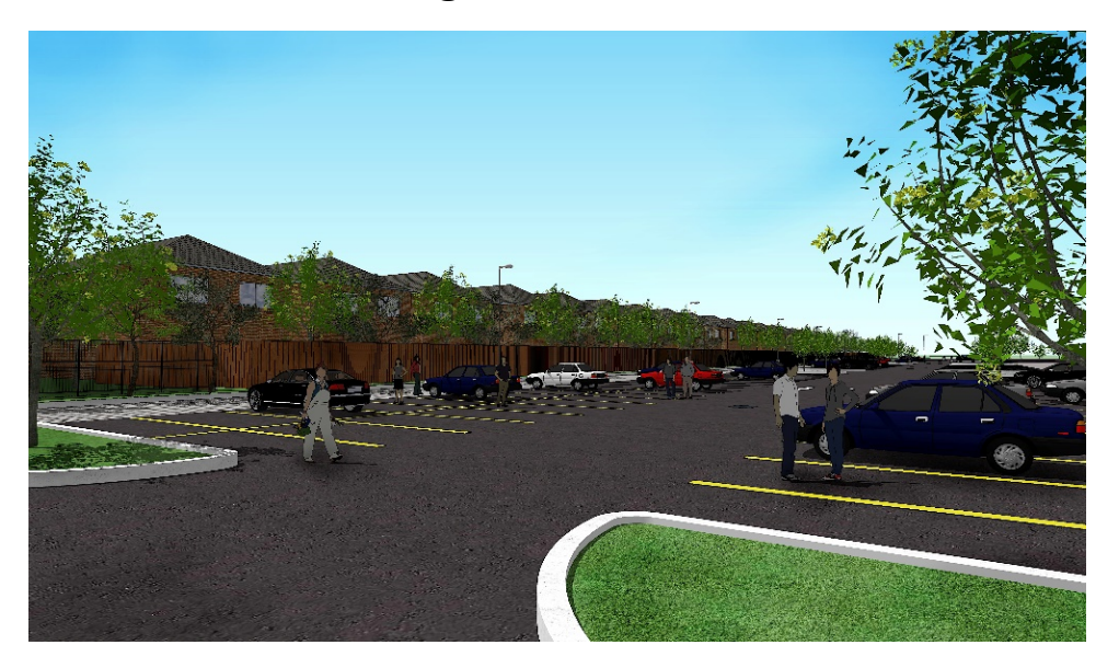
Rendering of new Mount Dennis Garage parking lot