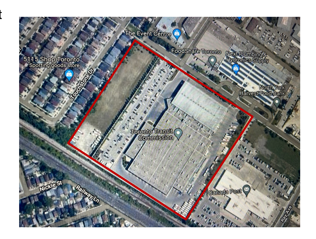
Aerial image of Mount Dennis Garage