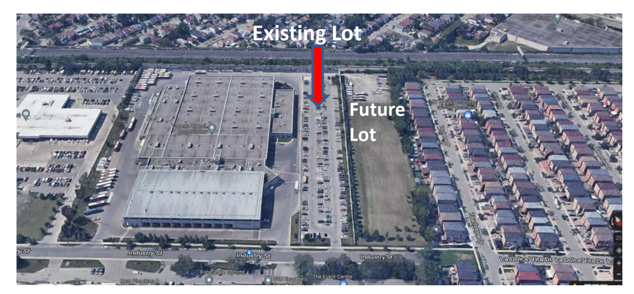
Mount Dennis Garage