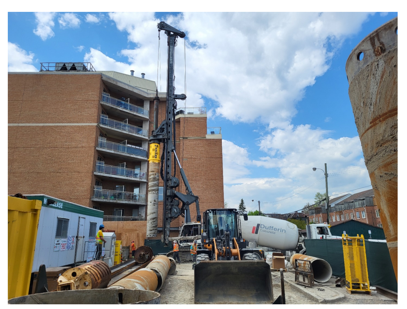
Drill rig and cement truck on the north side of Christie Station, looking north from Erlichman Ln.

Heavy construction is underway to build elevator shafts, this includes caisson drilling and excavation. Once drilling is complete on the north side of Christie Station, drilling will move to the south side of Christie Station.