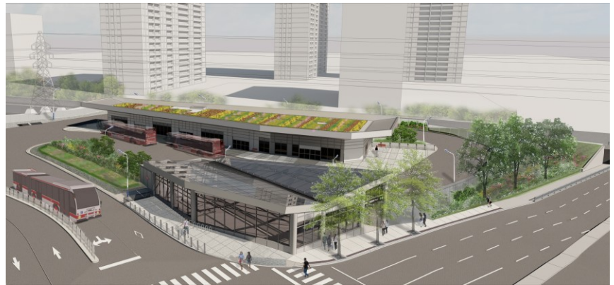
Artist's rendering of the new Islington Station Bus Terminal and Station Entrance, looking west on Islington Avenue and Aberfoyle Crescent. Finishes shown are subject to change.

As part of the TTC's Easier Access program, which systematically provides enhanced barrier-free accessibility for transit riders and pedestrians at subway stations across the city, Islington Station is slated to be modernized. This will include an entirely new bus terminal and station entrance, featuring plenty of natural light and a more accessible subway station platform.